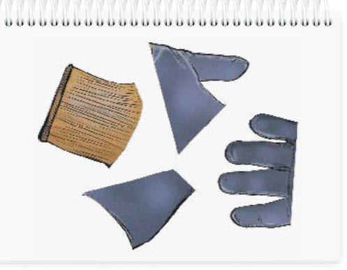
Identi-Fi: Clear, colorful, modern illustrations