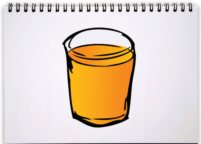
Others: outdated and potentially confusing line drawings