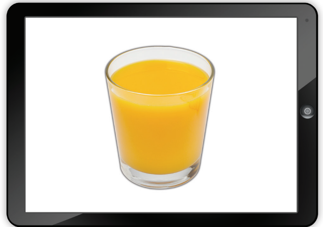
VAS: high-quality digital photographs